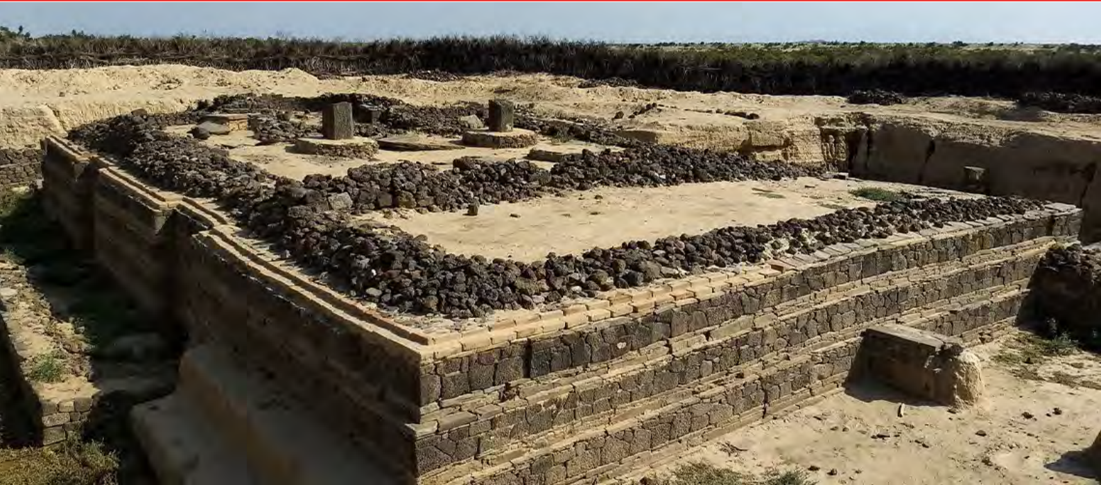
The Byzantine Basilica of Adulis, 5th century.