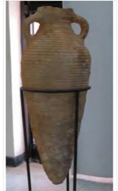
Amphora from Adulis

It is also possible to acquire information on pottery objects using X-ray techniques. One specific technique often used in pottery studies is called X-ray diffraction and allows us to identify minerals present in the pottery objects and the different phases resulting from firing of these objects. On the other hand, chemical analyses are done on pottery samples using different techniques to have information on their chemical composition. With the chemical approaches we can distinguish which objects were produced from similar raw materials or in the same place and which ones were produced using different materials.