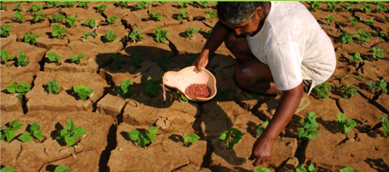
The Vazante Traditional Agricultural Systems, Brazil.