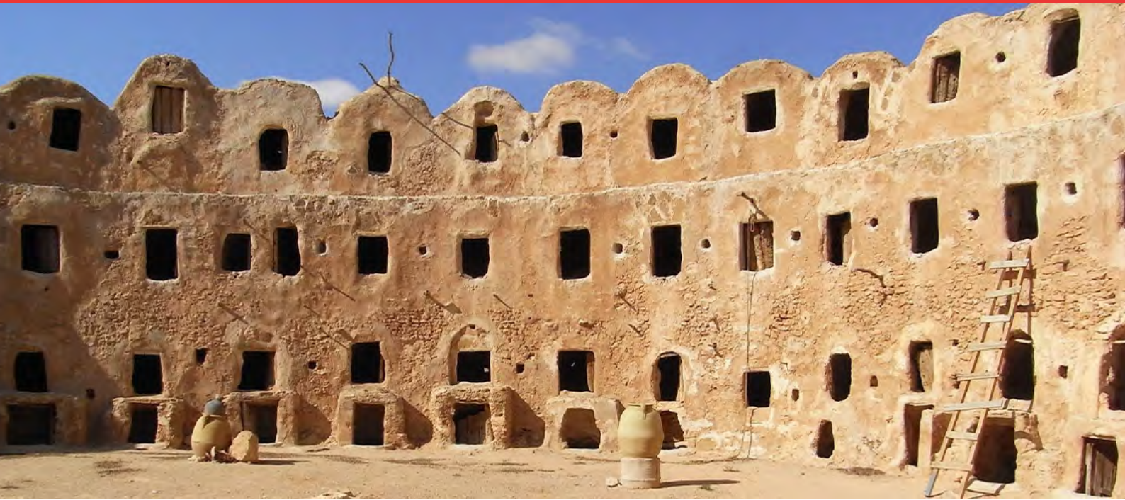
Qasr al-Hajj, Lybia: an example of earthen architecture