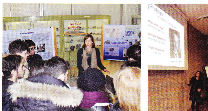
(LEFT) Students visiting the mineralogical section of the Earth science museum at the University of Bari. (RIGHT) Presentation of the lecture "1912–2012: A century of waves and crystals" at the University of Perugia