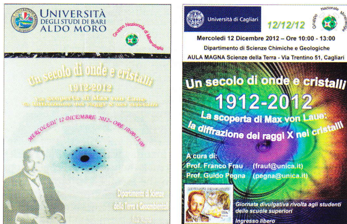
Two examples of posters advertising Laue Day

Near the end of 2012, the informal Italian group Gruppo Nazionale di Mineralogia (GNM) promoted an event aimed at celebrating the centennial of Max von Laue's discovery of X-ray diffraction in crystals. The event was called Giornata Laue ("Laue Day") and was planned to be held simultaneously in a variety of universities all over Italy and to be open to high school students. The event was devoted to the scientific explanation of the principles and application of X-ray diffraction, with emphasis on the importance of crystallography and its impact on society. The selected day was December 12, 2012 (12/12/12).