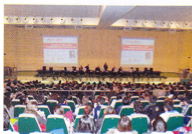
Introducing Laue Day before a large audience at the University of Parma

Ten universities participated in the initiative: the universities of Bari, Cagliari, Genova, Modena, Napoli, Parma, Perugia, Pisa, Roma La Sapienza, and Torino. In most cases, the GNM PowerPoint presentation was followed by guided visits to museums of mineralogy and laboratories of crystallography, where available. In museums, educational itineraries with posters, exhibitions of old X-ray instrumentation, optical benches, ripple generators, etc., helped the students to familiarize themselves with the phenomenon of "diffraction," whereas in crystallography laboratories, modern X-ray instrumentation was shown and experiments were carried out. In other cases, Laue Day was organized as a one-day workshop, with a cycle of seminars in the morning and practical activities in the afternoon.